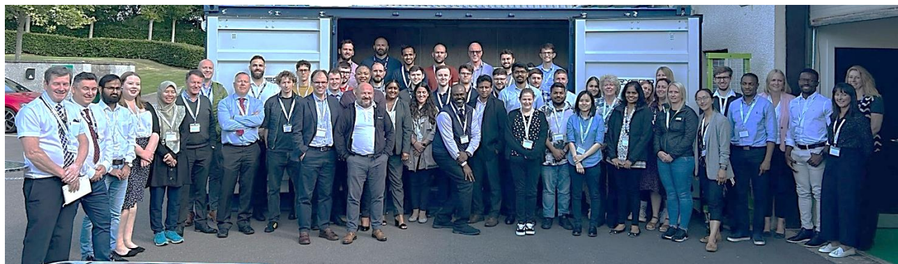
2023 CAD Group Photo

Step 2: Complete the Online Delegate Registration Form (to be completed by paid and sponsor delegates).